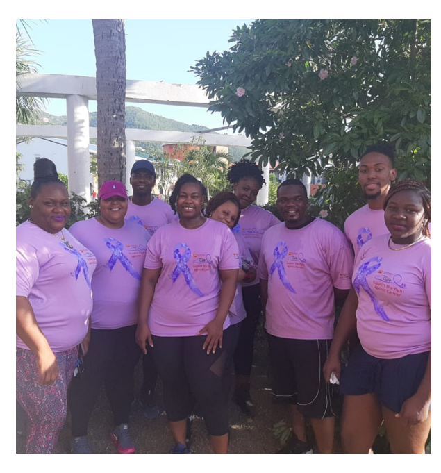
The soon to be established BVIEC Fitness Champions was envisioned while we walked for the cure and for a healthier life.